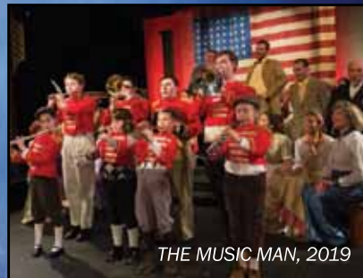
THE MUSIC MAN, 2019

The 2020 Season is underway, despite the COVID-19 interruption, Clear Space has produced CLUE, THE CURIOUS INCIDENT OF THE DOG IN THE NIGHT-TIME, KISS ME KATE, HIGH SCHOOL MUSICAL, URINETOWN and CONSTELLATIONS . The summer repertory season will begin June 23rd with SISTER ACT, LA CAGE AUX FOLLES on June 26th, and on July 1st CABARET opens. All three shows run each week throughout the end of August. On Saturday mornings in July and August catch the young company's presentations of CINDERELLA and HEROIC HERCULES for our younger patrons and those just young at heart.