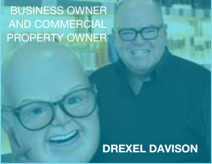
BUSINESS OWNER AND COMMERCIAL PROPERTY OWNER