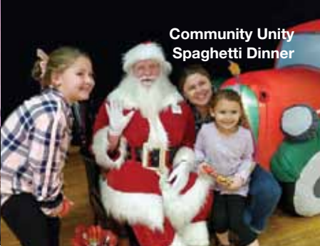
Community Unity Spaghetti Dinner