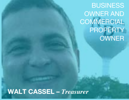
BUSINESS OWNER AND COMMERCIAL PROPERTY OWNER