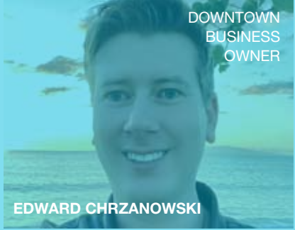
DOWNTOWN BUSINESS OWNER