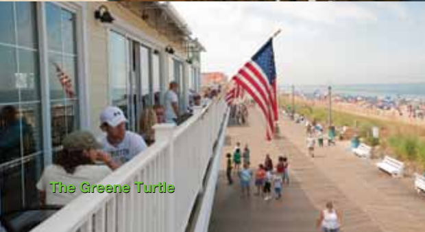
The Greene Turtle