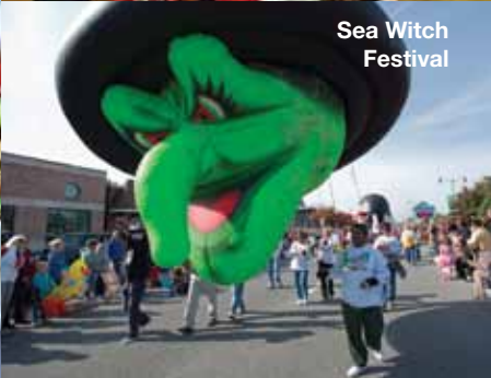
Sea Witch Festival