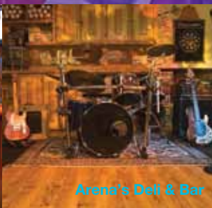
Arena's Deli & Bar