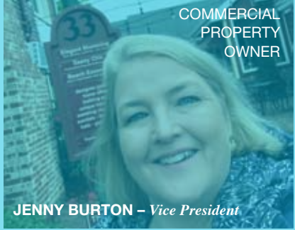
COMMERCIAL PROPERTY OWNER