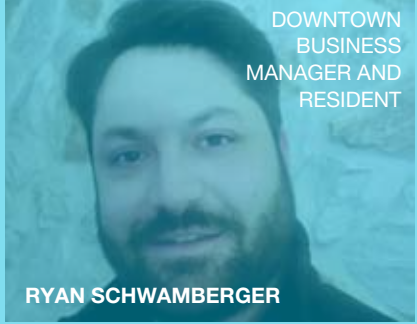
DOWNTOWN BUSINESS MANAGER AND RESIDENT