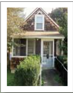
ANNA HAZZARD MUSEUM 17 Christian Street

The Rehoboth Art League was formed in 1938 in Henlopen Acres, as a place where artists could teach, gather, and exhibit their work. They boast more than 1,000 members who live across the county, offer more than 150 classes each year, annually hold more than 20 solo and group exhibitions of artwork, and produce special events such as our Salons, the Annual Cottage Tour, and our Outdoor Fine Art Show.