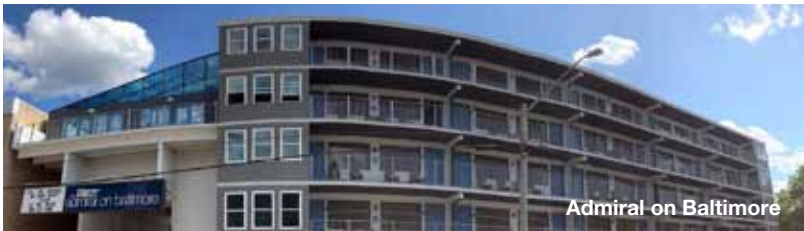
Admiral on Baltimore