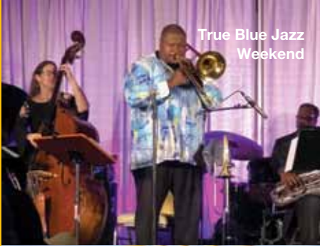
True Blue Jazz Weekend

Spring bursts with life with our Chocolate Festival, boardwalk and beach strolls, Easter bonnets, 5k walks, Restaurant Week, ArtWalk, and Paint-Out Weekend. Rent a bicycle, see new menus by our gourmet chefs, or greet the warming weather with pizza, fries and custard. Spring at the beach is a breath of sea air!