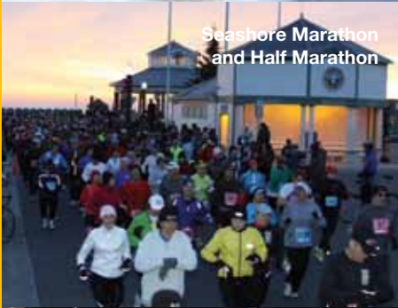
Seashore Marathon and Half Marathon