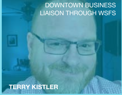
DOWNTOWN BUSINESS LIAISON THROUGH WSFS