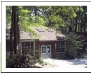
REHOBOTH ART LEAGUE 12 Dodds Lane / 302-227-8408

Located in Rehoboth Beach’s former ice house, the Rehoboth Beach Museum is the main way in which the Rehoboth Beach Historical Society celebrates the founding and history of Rehoboth Beach. Exhibits range from vintage postcards and bathing suits to original Civil War era maps and train schedules. All visitors to Rehoboth Beach are invited to stop by the Rehoboth Beach Museum to learn more about the rich, distinct history of this special little corner of the world.