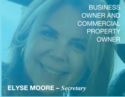
BUSINESS OWNER AND COMMERCIAL PROPERTY OWNER