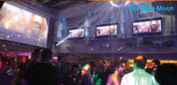
The Blue Moon