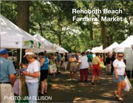
Rehoboth Beach Farmers' Market