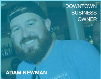
DOWNTOWN BUSINESS OWNER