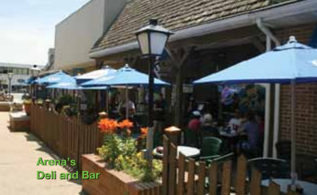
Arena's Deli and Bar