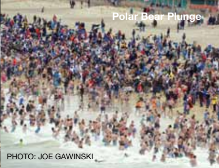
Polar Bear Plunge